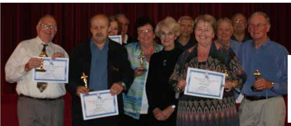
NVM Ruff Productions crew and some cast receiving their award for 'Ruff Justice'