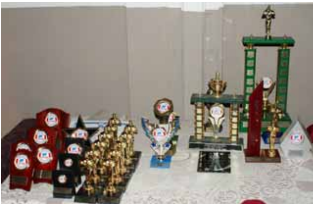
The trophy table for the Nation Festival in October.