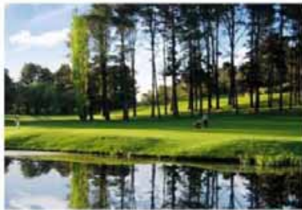
Yowani Country Club